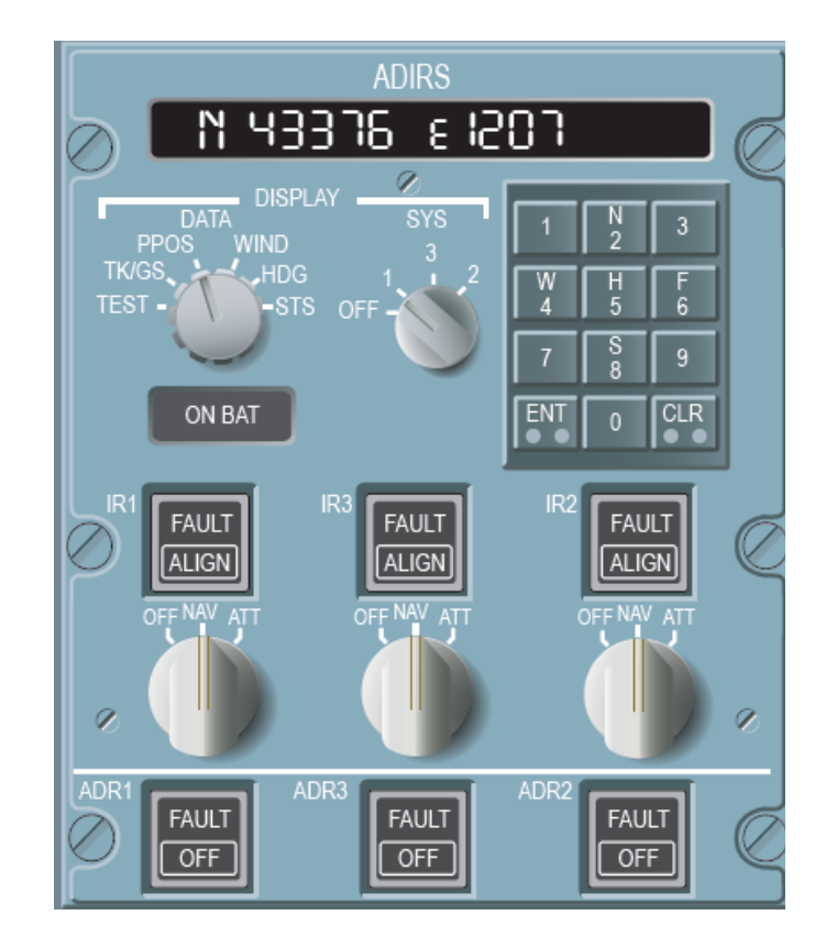
Figure 2 ADIRS Control Panel