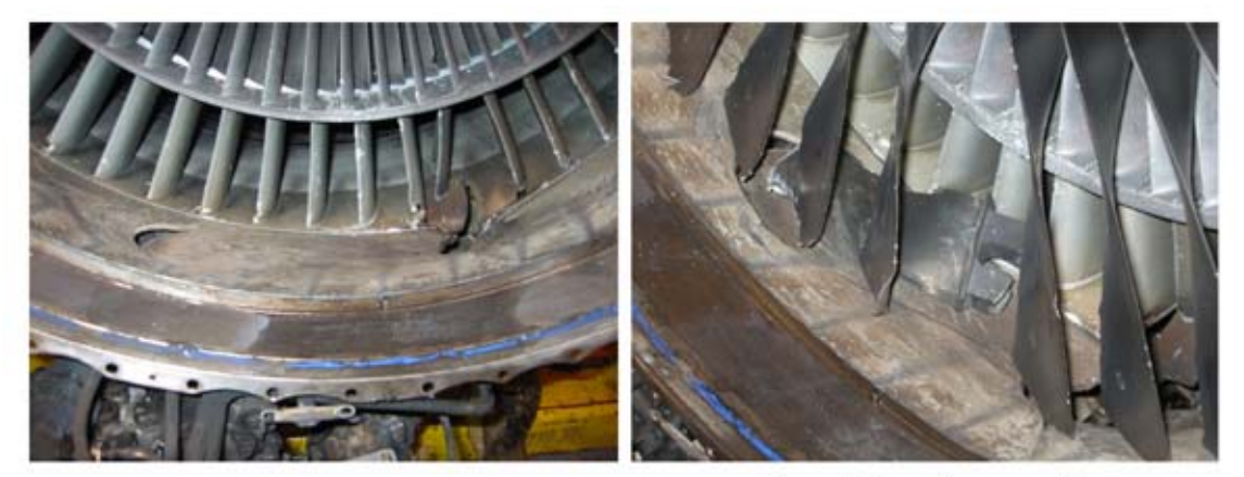
Second stage assembly removed casing penetrations at 5-7 o'clock positions

The penetration marks on the fan case were consistent with fan blade release kinematics. The initial blade tip impact was in the plane of rotation and the impact of the blade root was aft of the plane of rotation. Both impacts tore the containment case. It is probable that no significant material exited through these penetrations as only one piece of blade strap material was recovered from inside the cowling. There was no evidence of cowl penetration.