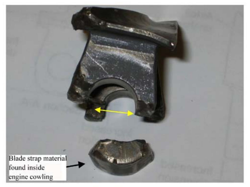
Figure 2 LP compressor second stage blade failure

The fan discharge vanes were severely damaged in the area of the case rupture and also in the 1 to 3 o'clock position. This appeared to have been caused by the liberated blade being dragged around just prior to final release or just after release. It is likely that the blade tip material exited via this route. There was also some damage to the core inlet guide vanes.