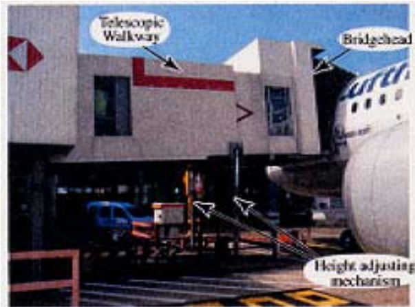
Plate 1 Rail-drive airbridge