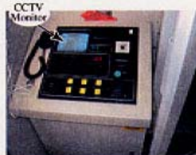
Plate 2a Control console on older type apron-drive airbridge (faces forwards)

Illustrations showing relevant features of types of airbridge in use in Terminals 2 and 3 at London Heathrow, Central Area.