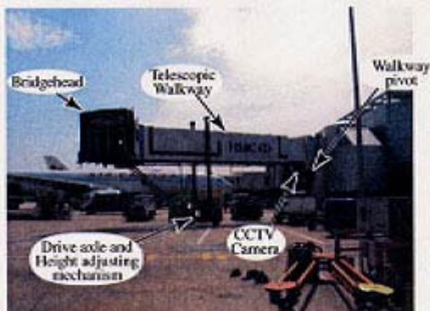
Plate 3 Latest type apron-drive airbridge