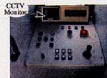
Plate 3a Control console on new type apron-drive airbridge