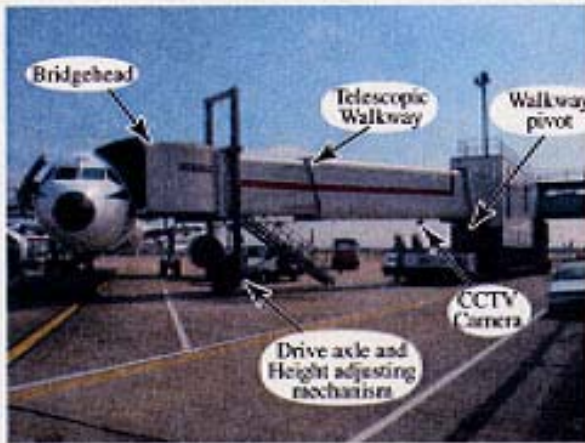
Plate 2 Older type apron-drive airbridge