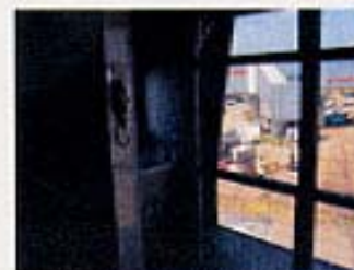
Plate 3b Console in alcove facing side window

These have all been supplied by one manufacturer and have subsequently been updated to a common standard. They are in use at all the terminals in the Heathrow Central Area.