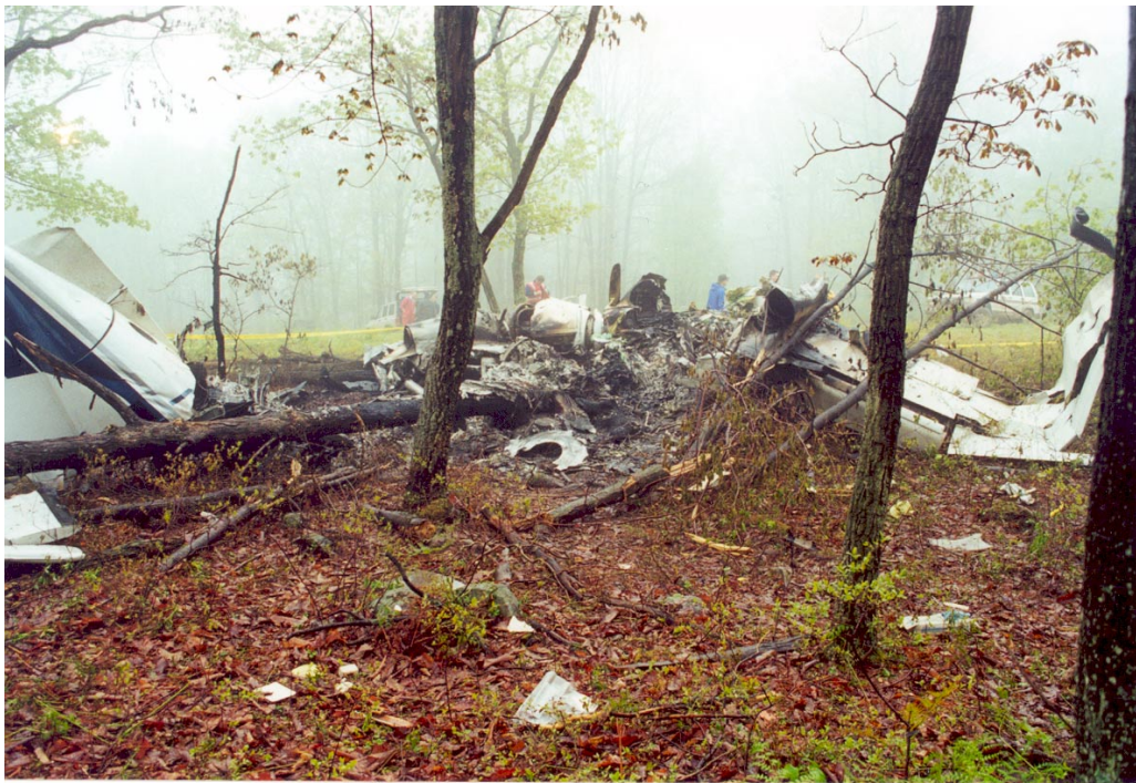
Figure 2. Photo of the accident site illustrating the lack of fire damage to the surrounding area.

The airplane wreckage was found on the top of a mountain on the east side of a pipeline clearway on state-owned property. Ground and tree impact marks indicated that the airplane impacted terrain at a steep angle and in an extreme bank angle. Witness marks on the attitude indicator, ground witness marks, airplane crushing, and other damage indicated that the airplane impacted the ground at a 60° nose low attitude and in a 135° left bank. Ground scars indicated that the airplane impacted the ground on a 40° heading. All of the airplane's primary structure was located at the accident site. All recovered primary and secondary flight control surfaces were found at the accident site. As shown in figure 2, fire damage was confined to the immediate impact area, with little fire damage to surrounding trees and foliage.