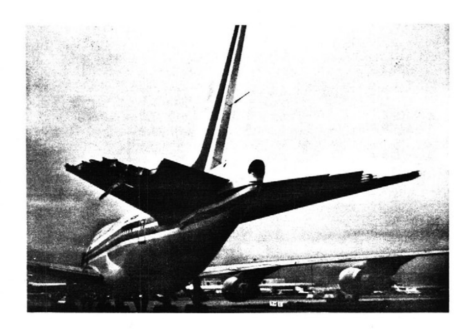
Figure 8.-Photograph of Empennage.