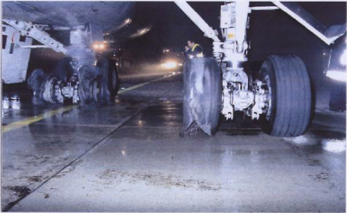
The damaged L/H Main Gear and L/H Body Gear