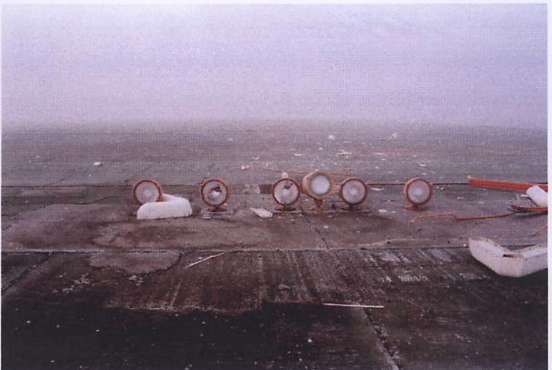
Parts of localizer antenna between the approach lights