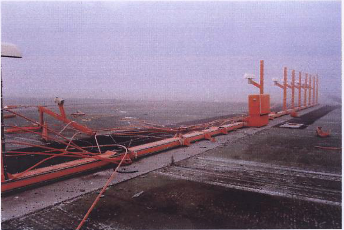
Destroyed localizer antenna of RWY 07R