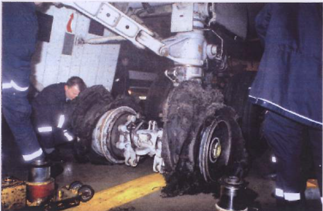
Details of L/H Body Gear, burned tires