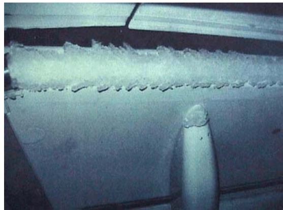
Photo 1. Ice accretion on main flaps leading edges from a December 1998 A321 event

In December 1998, two similar events occurred involving a foreign carrier's A321 aircraft landing in CONFIG FULL in icing conditions. The roll oscillations were attributed to ice accretion, particularly on the flap leading edges, affecting the slot between the main flaps and wing box. Because the main flaps are similar on the A320 and A321, and no events of this nature were ever reported on the A320, the icing conditions were considered to have caused the events and no changes to the