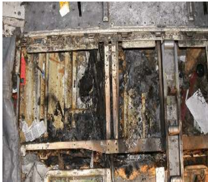
Photo 1. Fire-damaged area

The fire was located below the floor level of the aft cargo compartment in an area defined longitudinally by fuselage station (FS) 1385 and FS 1412 and laterally by left buttock line 3 (LBL) 6 and right buttock line (RBL) 50. The fire burned holes through the structural floor beam web at FS 1395, and consumed the thermal acoustic insulation on both sides of the floor beam. Also damaged were the underside of the floor board between RBL 22 and RBL 44, potable water lines, heater ribbons, and associated electrical wiring (see Photo 1).