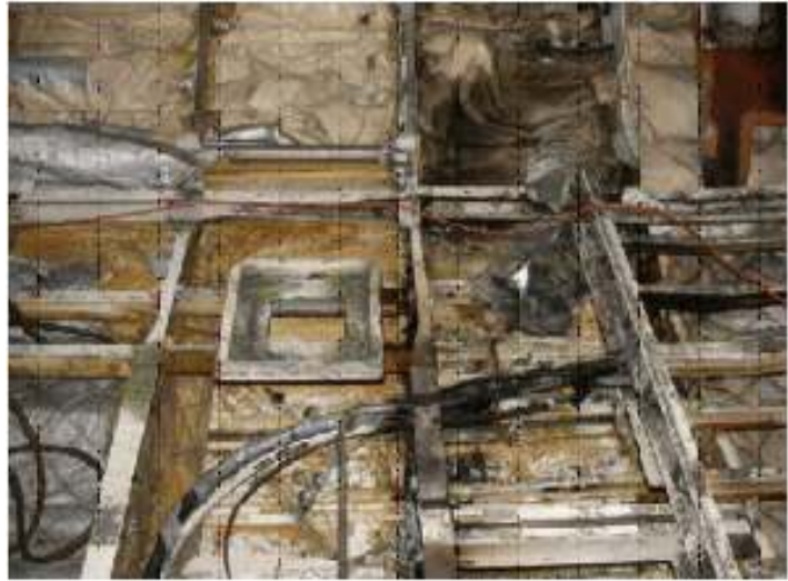
Photo 3. Fire-damaged area

The Electrofilm brand heater ribbon failed aft of FS 1395. The heater ribbon was laid longitudinally along the water line and over the repair site. The heater ribbon overheated and arced at the forward edge of the repair, where the original water line ended and the stainless steel began. This resulted in the heater ribbon burning through the protective tape and the Rubatex foam insulation. Because electrical power was still being provided to the heater ribbon, the failure continued to move forward along the water line toward the source of electrical power.