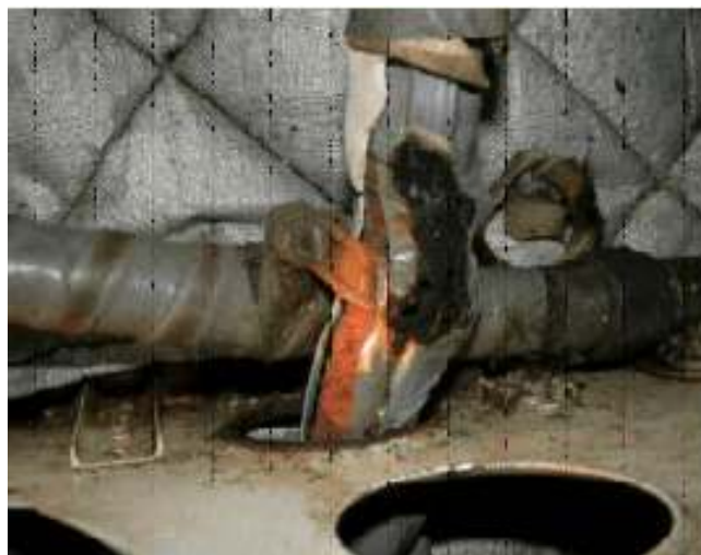
Photo 5. Burned heater ribbon behind aft wall

In addition to the fire damage associated with the occurrence flight, TSB investigators found a burned Cox & Company heater ribbon, protective tape, and Rubatex foam insulation behind the aft wall of the aft cargo area on the occurrence aircraft (see Photo 5). Although a self-propagating fire had not occurred, the area had become hot enough to burn through the Rubatex foam insulation and a nearby plastic clamp.