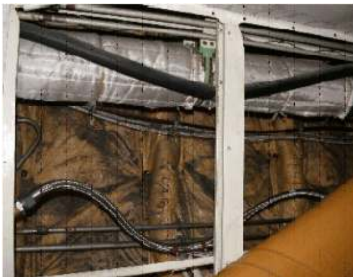
Photo 7. Dust and lint accumulation on thermal acoustic insulation behind wall panel