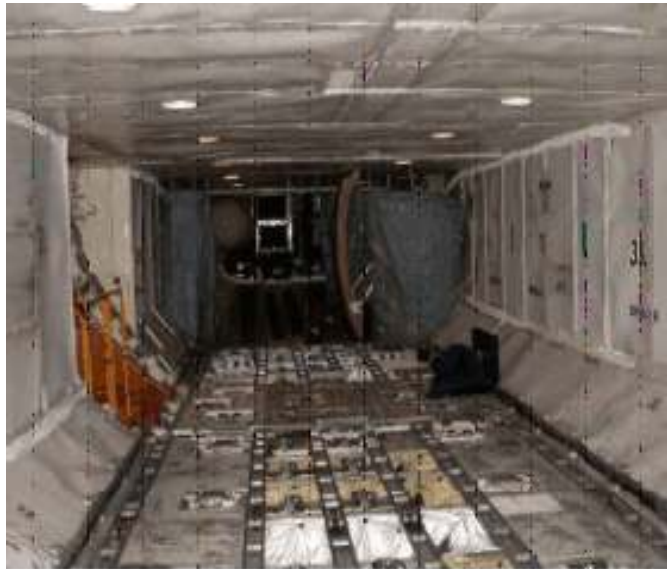
Photo 2. Aft cargo compartment

There are two cargo compartments on the passenger version of the Boeing 767: the forward compartment located ahead of the wings and the aft compartment located behind the wings. The aft compartment is subdivided into a main section and a bulk cargo section (see Photo 2). The bulk cargo section is at the aft end of the aft compartment and has an aluminum sloping floor due to the geometry of the aircraft. The bulk cargo area is separated from the main section by a cargo-restraining net and can be accessed independently through a door on the left side of the aircraft. There are six roller tracks with power drive units (PDUs) to facilitate moving cargo/baggage containers longitudinally through the cargo compartments. The tracks are located at buttock line (BL) 44, BL 22 and BL 6 left and right. The PDUs are controlled by externally accessed controls located behind a panel, adjacent to the cargo compartment door, on the right side of the aircraft.