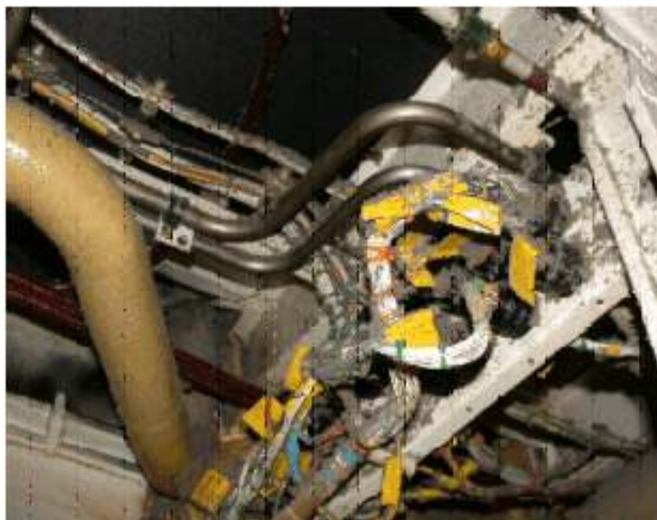
Photo 6. Dust and lint accumulation on wiring bundles behind wall panel

The Board is concerned that the FAA action is limited to Boeing 747 and 767 aircraft, because only these Boeing aircraft have open cargo floor areas. The FAA believes that heater ribbons do not need to be removed or replaced in closed-in areas, because such areas do not accumulate sufficient debris and contamination to pose a risk of a self-sustaining fire. The Board does not share this view. Both the TSB and the National Transportation Safety Board (NTSB) have previously issued safety communications concerning the fire hazard associated with the accumulation of lint, dust, and debris on wires. As well, both TC and the FAA have previously issued communications recognizing that the flammability of most materials can change if the materials are contaminated, and that contamination may be in the form of lint, dust, grease, etc., which can increase the material's susceptibility to ignition and flame propagation. Despite all of the action taken to date by the various agencies, the problem of contamination in closed-in areas still exists (see photos 6 and 7). As detailed in this report, dust and lint accumulation on wires has led to self-sustaining fires in closed-in areas, and the potential for such fires still exists. Consequently, the lack of FAA action concerning closed-in areas does not mitigate the safety deficiency in these areas.