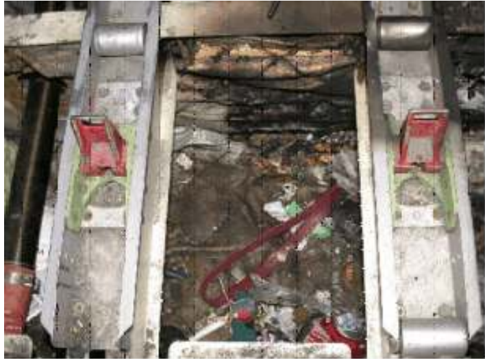
Photo 4. Contaminated insulation blankets and debris

Contaminated thermal acoustic insulation blankets in the vicinity of the heater ribbon provided fuel for the fire. The contamination consisted of soiled insulation blankets and of flammable debris in the form of paper, candy wrappers, Styrofoam packing peanuts, small polyethylene beads, and rubber powder from a PDU (see Photo 4). Samples of the burnt PET-covered insulation blankets were analyzed for the presence of fire accelerants. An isoparaffin solvent was detected. These types of solvents are often clear combustible liquids that readily form